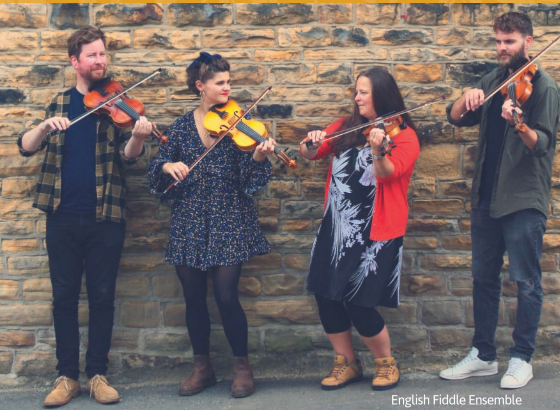
English Fiddle Ensemble