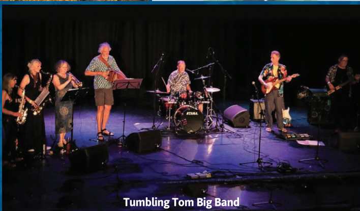
Tumbling Tom Big Band