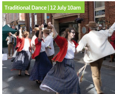
Traditional Dance | 12 July 10am

Buy tickets for 2 Coro concerts to earn 10% discount, 3 events – 15% discount, 4 events – 20% discount