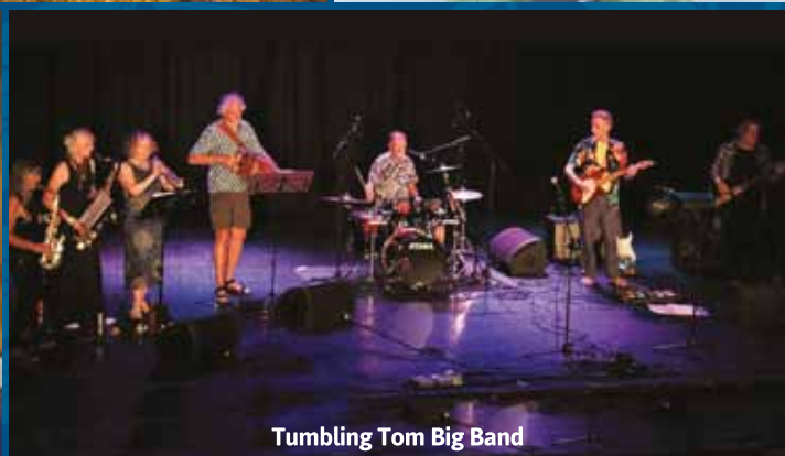
Tumbling Tom Big Band